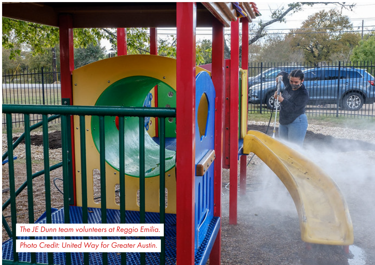
The JE Dunn team volunteers at Reggio Emilia.

In this time of economic uncertainty, some providers have foregone needed renovations due to limited funds, staff capacity, or alternative priorities in the wake of COVID-19. Local volunteers stepped in to lend their skills at two local child care centers in Austin by updating and repairing the infrastructure of the buildings. JE Dunn Construction recently completed skills-based volunteer projects at Sweet Briar Child Development Center and Reggio Emilia in Oak Hill. JE Dunn is a long-time corporate partner of United Way for Greater Austin and both child care centers are part of Pre-K Partnerships (the previously mentioned collaboration between United Way for Greater Austin and Austin ISD).