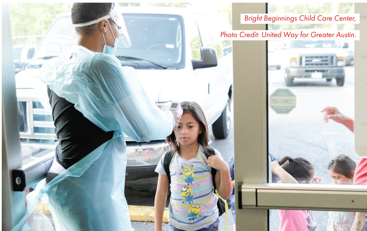
Bright Beginnings Child Care Center,

On March 13th, when the City of Austin established the local government Emergency Operations Command center for COVID-19 Response, the Austin Public Health Department established a Child Care Task Force primarily comprised of key stakeholders from the Austin/Travis County Success By 6 Strategic Plan Leadership team with a purpose to guide important decisions that could have lasting impacts on the Austin-Travis County child care ecosystem. This group later evolved to develop a subgroup of representing program leaders from licensed home and center-based programs to help inform the task force in their initiatives. Through each step of its evolution, the task force has sought to protect the Austin-Travis County child care ecosystem by connecting providers and their