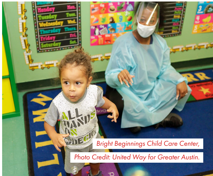
Bright Beginnings Child Care Center,

Recognizing that the most beneficial action would be informed by local data, the task force also established a robust supply needs survey and response where Austin Public Health has been able to provide essential supplies to the child care programs open and operating. Most notably, the task force became the catalyst for the $1M Child Care Relief Fund distributed to licensed and registered providers in July, and they have been involved in securing an additional $5M in relief funding for providers through the City of Austin SAVE(S) Resolution. This task force continues to meet and will continue as long as needed, providing essential information for City and County government as well as informing the efforts of the Austin/Travis County Success By 6 Coalition in advocacy.