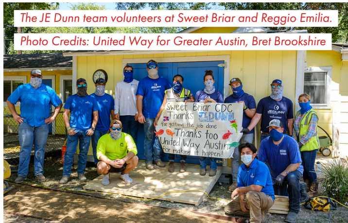
The JE Dunn team volunteers at Sweet Briar and Reggio Emilia.