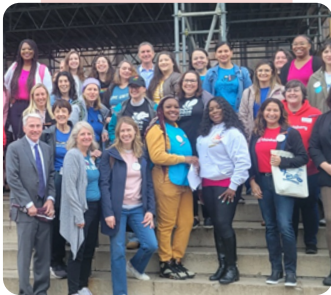
Child advocates on South Capitol Steps in Austin, TX

CHILDREN AT RISK emphasizes the importance of high-quality early childhood education, especially for mitigating poverty's effects on children from low-income families. We focus on ensuring access to affordable, quality early education and strengthening a well-supported early childhood workforce, aiming to improve academic success and support critical brain development in the early years.