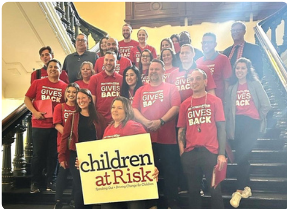
Mattress Firm staff advocating for basic needs.