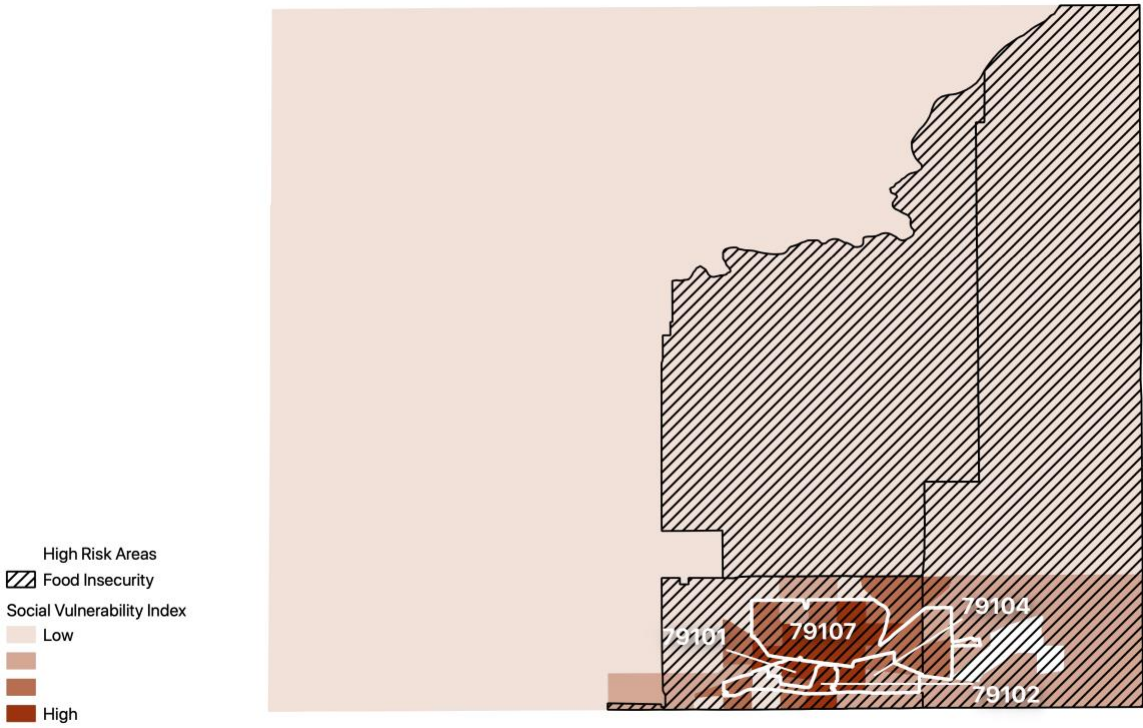
Map 2. Food Insecurity and Social Vulnerability

Map 2 shows the CDC’s Social Vulnerability Index (SVI), an indicator of vulnerability during crisis. The darkest red shows the top quartile (1/4) of highest concentration of most vulnerable people. This index includes socio- economic status, household composition and disability status, minority/language status, and housing and transportation status. The black dashed areas show school districts where more than 50% of students are enrolled in free and reduced-cost meals.